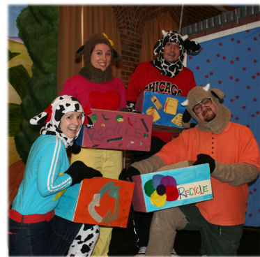
Go to www.schoolrecycling.net to learn more about the RecyclaBulls.

Grant funding of $883 is available to help defray the cost of this live theater production. School will need only to fund raise $300. This would be a great way to start or strengthen your school recycling and environmental education program. Applications are due by May 26th and performances will