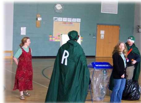
Respecto-Man and Boy Manners helped teach students about recycling.

It's easy: No rinsing or washing Finish a Capri Sun Remove the straw Put it in the collection bin