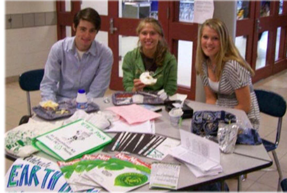
Bow students educate peers on "green" practices.

The Bow Elementary School (BES) kicked off their school recycling efforts this year by joining BHS for the Junkman performance on September 18th at the high school. BES joined The Club last school year, and since then has earned the Bronze Award, too. Parents and teachers are coordinating with school administrators to create a school-wide progressive recycling